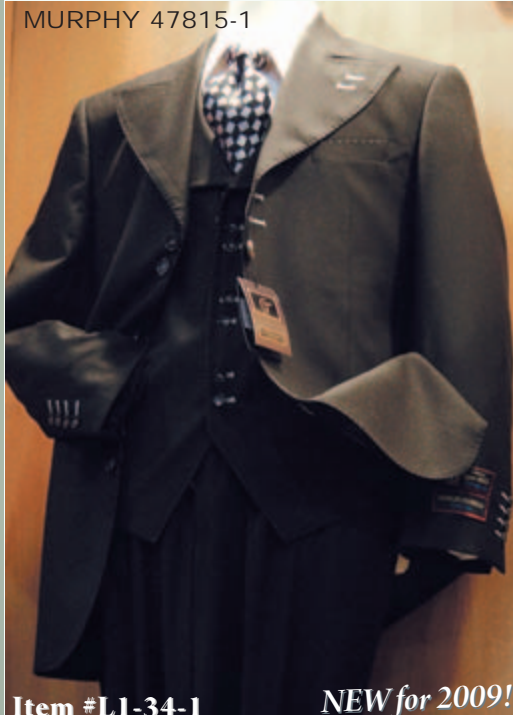
Item #L1-34-1 NEW for 2009!