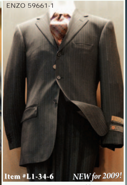
Item #L1-34-6 NEW for 2009!

Sizes: 38 - 56R, 40 - 60L. Color: Grey Combo.