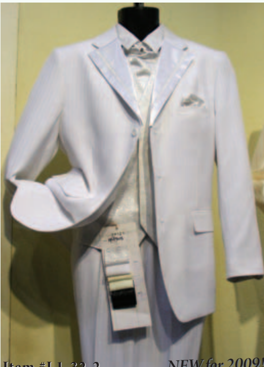
Item #L1-32-2 NEW for 2009!