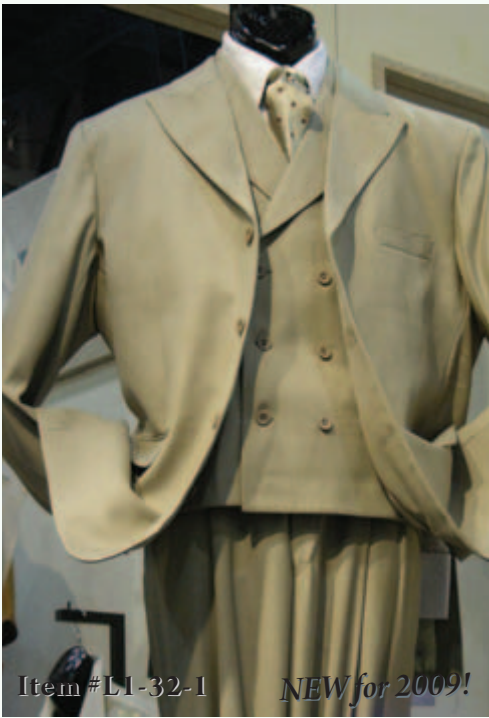
Item #L1-32-1 NEW for 2009!