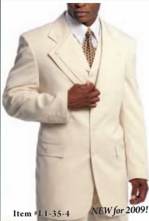
Item #L1-35-4 NEW for 2009!

• 3 Piece, 3 Button Suit. • Layered Lapels, • Tabs on Side Vents, • Lapel Vest, • Pocket Details, • Semi Wide Leg Pants. • Poly/Rayon.