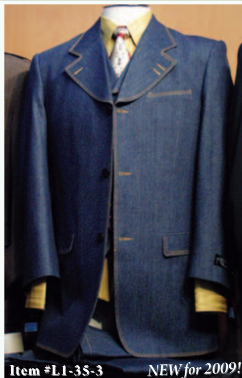
Item #L1-35-3 NEW for 2009!

• 3 Piece Suit, • 3 Buttons with Rounded Lapels, • Genuine Denim w/Pic Stitch Edging, • 100% Cotton.