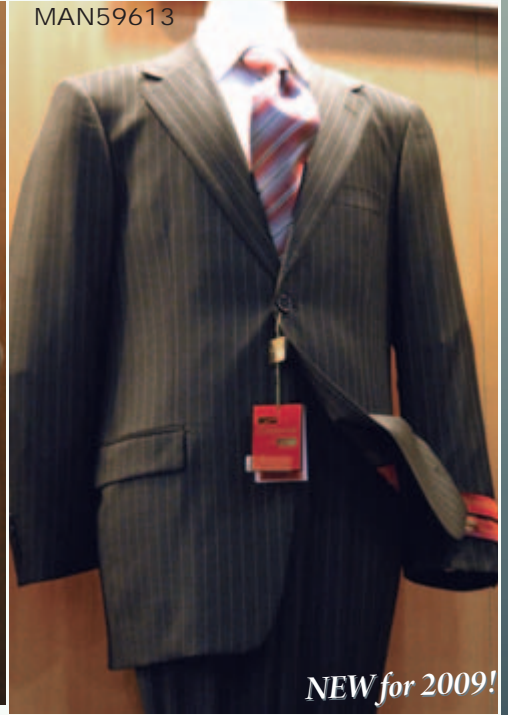
Item #L1-34-3 NEW for 2009!

Sizes: 38-54R, 42-54L, 38-44S. Colors: 1 White, 7 Natural , Charcoal, Brown, Camel.