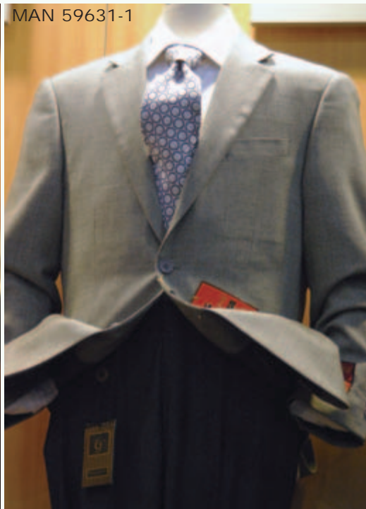
Item #L1-34-5 NEW for 2009!

Sizes: 38 - 56R, 40 - 60L. Colors: 5 Camel , Black, Navy, Grey.