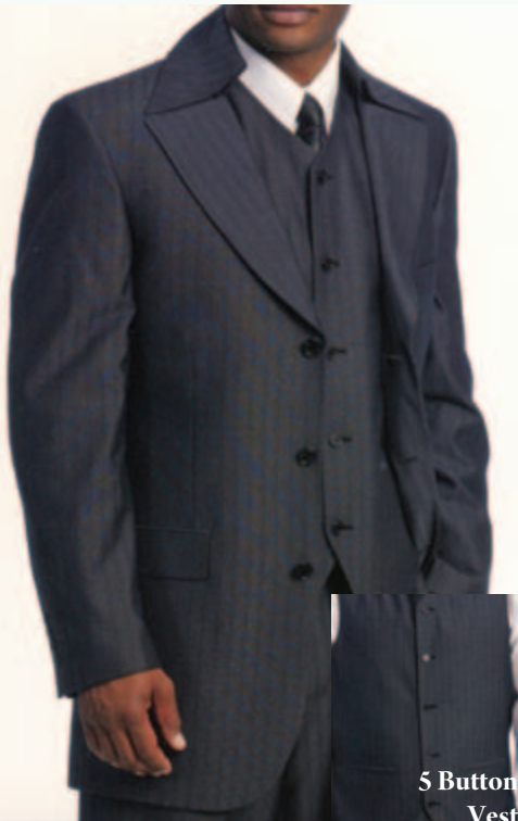
5 Button Vest