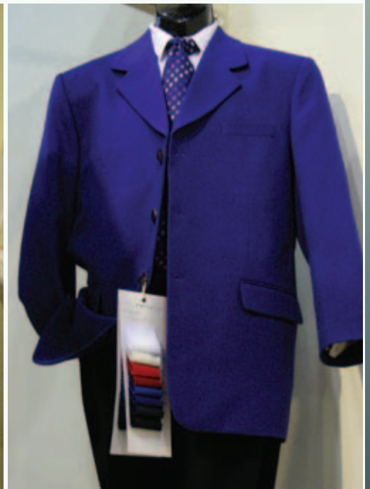
Item #L1-32-3 NEW for 2009!