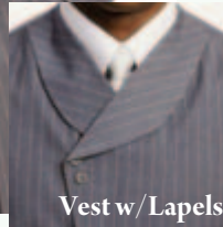
Vest w/ Lapels