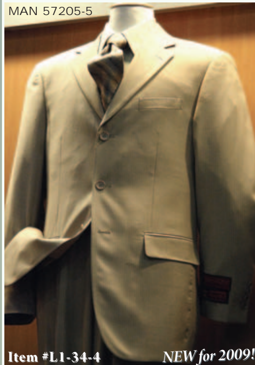
Item #L1-34-4 NEW for 2009!

Sizes: 38-56R, 40-60L. Colors: 1 Black, 2 Navy, 3 Charcoal .