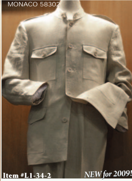
Item #L1-34-2 NEW for 2009!

Sizes: 38 - 56R, 42 - 60 L. Color: Black.